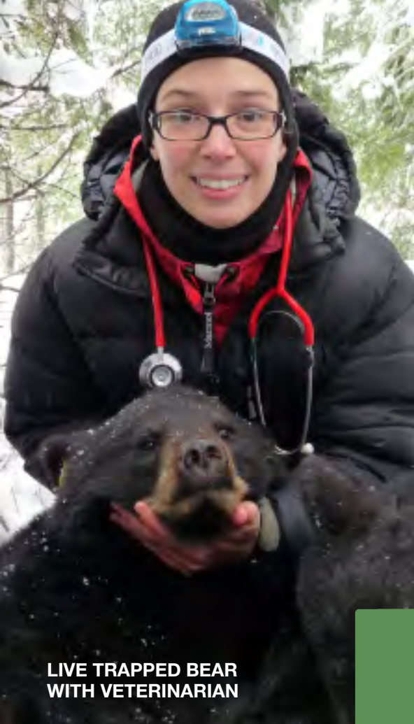
LIVE TRAPPED BEAR WITH VETERINARIAN