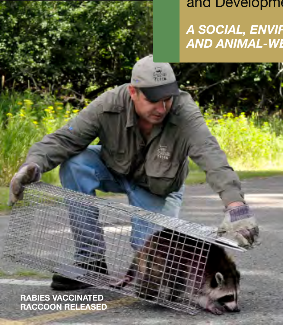
RABIES VACCINATED RACCOON RELEASED

A SOCIAL, ENVIRONMENTAL, AND ANIMAL-WELFARE PERSPECTIVE