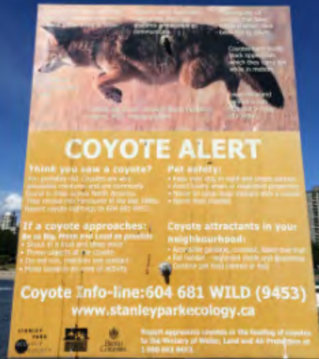
COYOTE IN URBAN ENVIRONMENT

Canada's trap research program was established 35 years ago in response to international concerns about animal welfare in the fur industry.