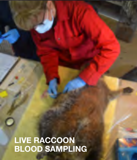
LIVE RACCOON BLOOD SAMPLING