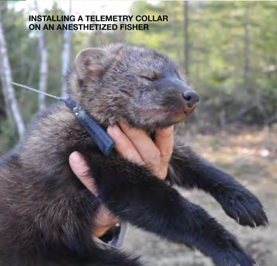
INSTALLING A TELEMETRY COLLAR ON AN ANESTHETIZED FISHER

Canada's pioneering trap research and development program is coordinated by the Fur Institute of Canada, and conducted in collaboration with the laboratories of InnoTech Alberta.