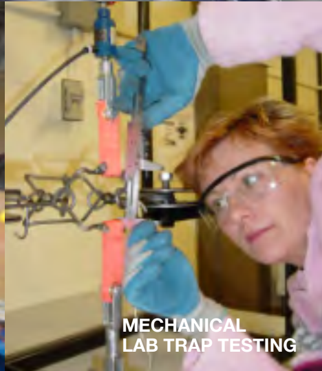
MECHANICAL LAB TRAP TESTING